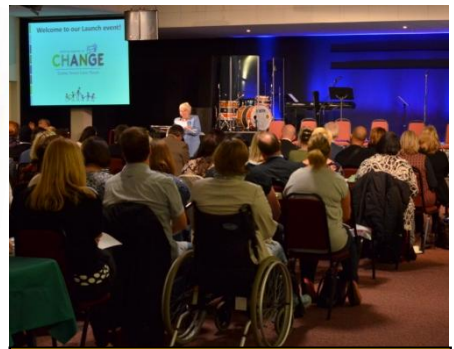
The Deputy Mayor opens the event

Voting on Panel questions should have been done by parent carers only