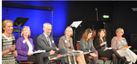
The Panel answer parent's questions

Panel questions should have been on screen whilst being answered